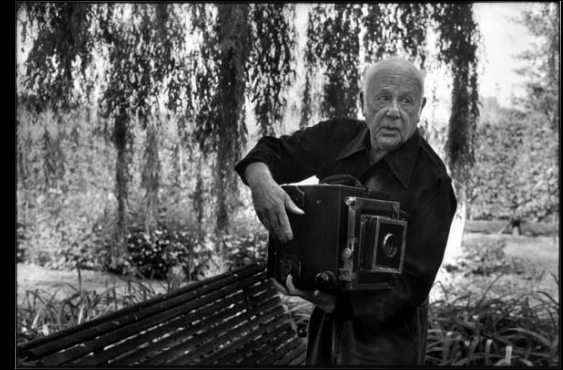
Paul Strand (Fellow Photographer)

Allowed Adam's to use the family home as a studio for his work